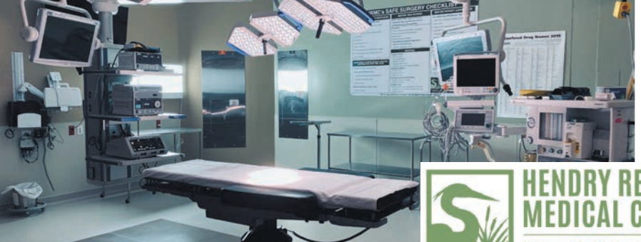
Common surgical procedures available at Hendry Regional Medical Center make recovery easier.

raveling long distances can add to the stress and discomfort of surgery. The need to travel to and from a facility outside the community can also cause a burden for family members. Fortunately for Hendry County residents, common surgical procedures are available at Hendry Regional Medical Center.